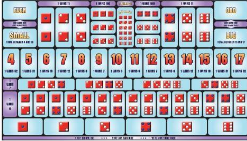
DIAGRAM C Super Streak Layout