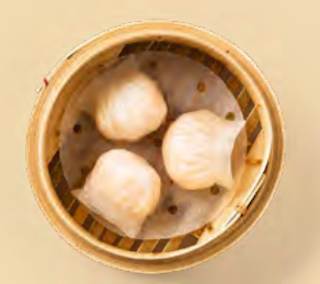
筍尖鮮蝦餃 (g) Har Gao (Prawn Dumplings) with Bamboo Shoots $14.8