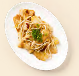
XO醬煎腸粉 〇 Ø Pan Fried Rice Noodle Roll with XO Sauce $16.8

Abalone Dumplings, Prawn Dumplings, Spinach, Crab and Prawn Dumplings, Turnip Puff Pastry, Chicken Spring Rolls, Deep Fried Taro Dumplings $53.8