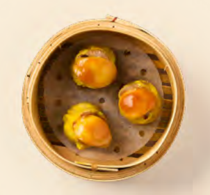
鮑魚燒賣 ♀ Steamed Prawn & Pork Dumplings with Abalone $18.8