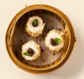
黑松露雞燒賣 O Chicken Shu Mai with Truffle $18.8

排骨豬腸粉 Rice Noodle Roll with Pork Ribs $16.8