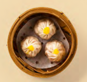
上海小籠包 Shanghai Xiao Long Bao (Mini Soup Dumplings) $14.8