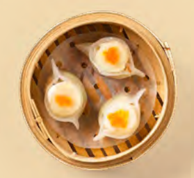
碧綠带子餃 ③ Crab Roe & Scallops Dumplings $14.8