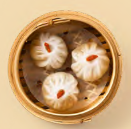
金菇素菜餃 《 Enoki Mushroom & Vegetable Dumplings $14.8