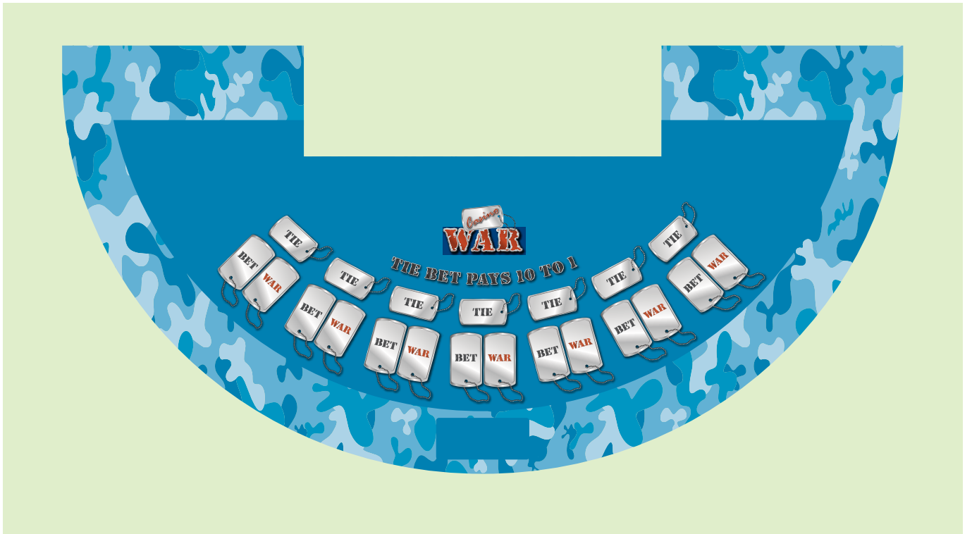
Indicative table design