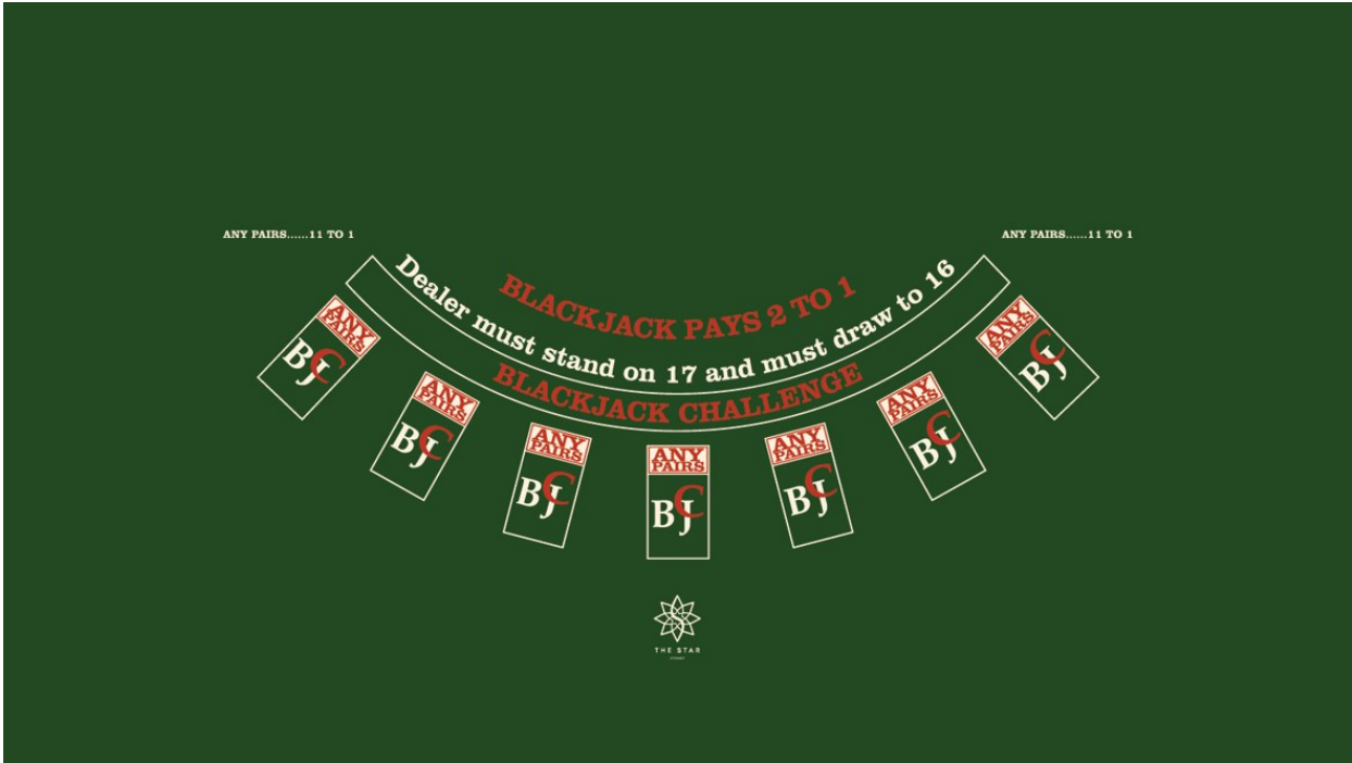
Indicative table design, actual design and optional wagers may differ on the casino floor to what is shown above.