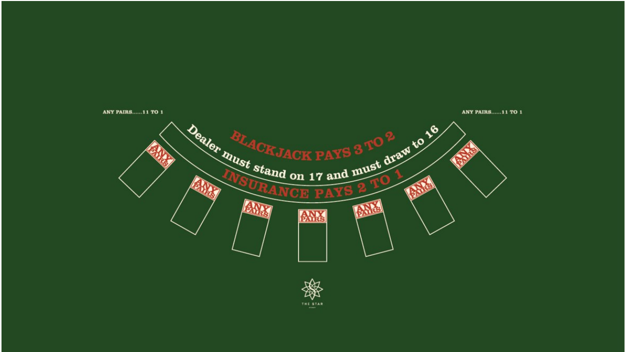
Indicative table design, actual design and optional wagers may differ on the casino floor to what is shown above.